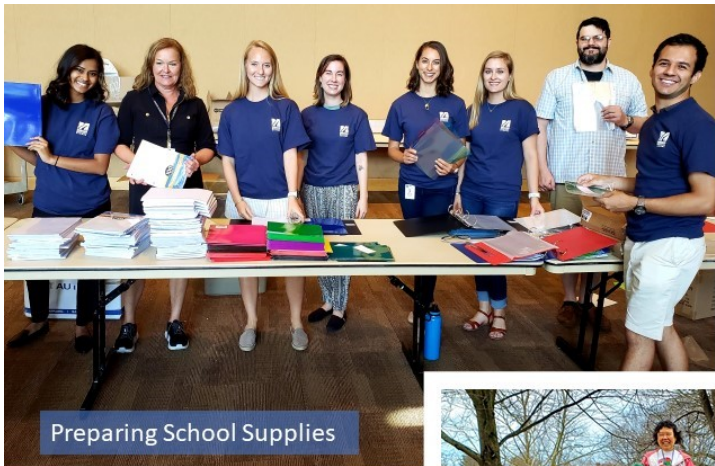
Preparing School Supplies

The CEC provides guidance and support to the medical school and Greater Worcester communities to foster, advance, and strengthen community-engaged service, learning and research and promotes participation in the 2016 Greater Worcester Community Health Improvement Plan (CHIP).