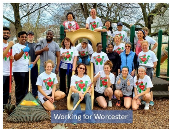
Working for Worcester