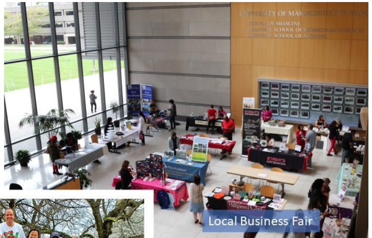
Local Business Fair