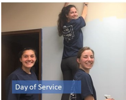
Day of Service