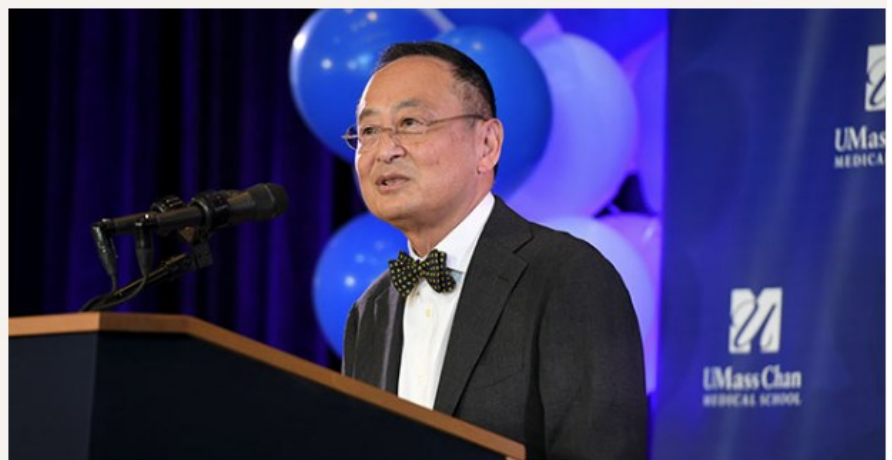
Gerald Chan speaking at the campus celebration on Sept. 7, 2021

What an emotional week it's been at UMass Chan Medical School, with more celebrations to come! Here are some photos from the announcement of the transformational gift from The Morningside Foundation. Read about our news: https://bit.ly/3k6Xto4