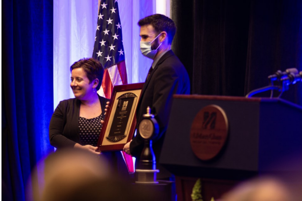
Veterans Inc.: Outstanding Community Clinical Partner Award

Congratulations to our students and preceptors that received awards