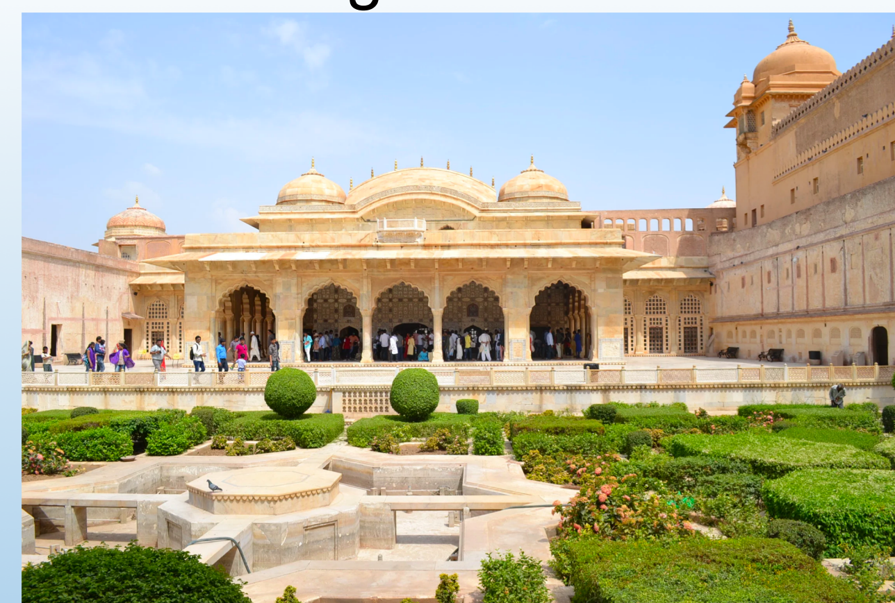
Amer fort, Jaipur