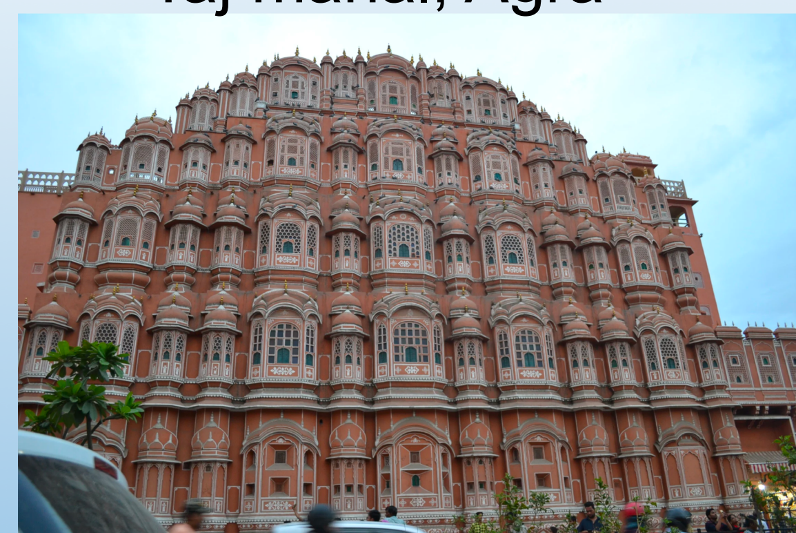
Hawa mahal, Jaipur