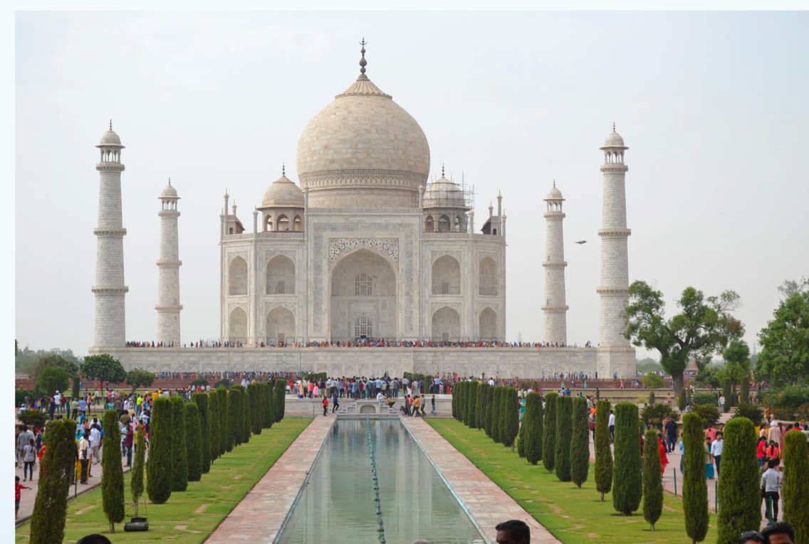
Taj mahal, Agra