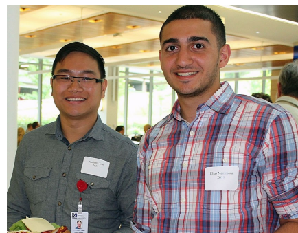
The Baccalaureate MD program matriculated its first cohort of students: