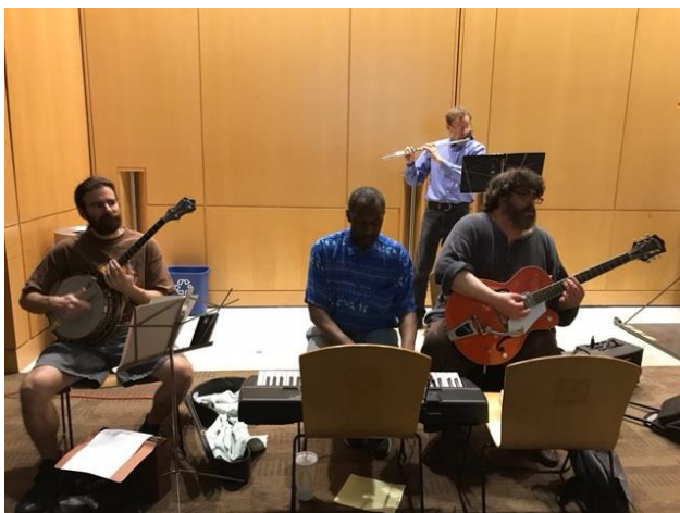
Community Healthlink's Jaques 5 Band playing during the event.