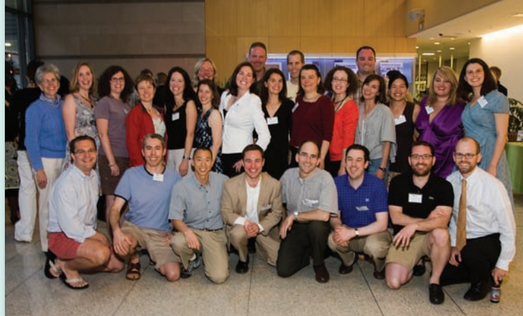
▲ Members of the class of 2000