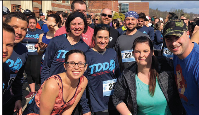
Supporters at the first TDD 5K in 2019