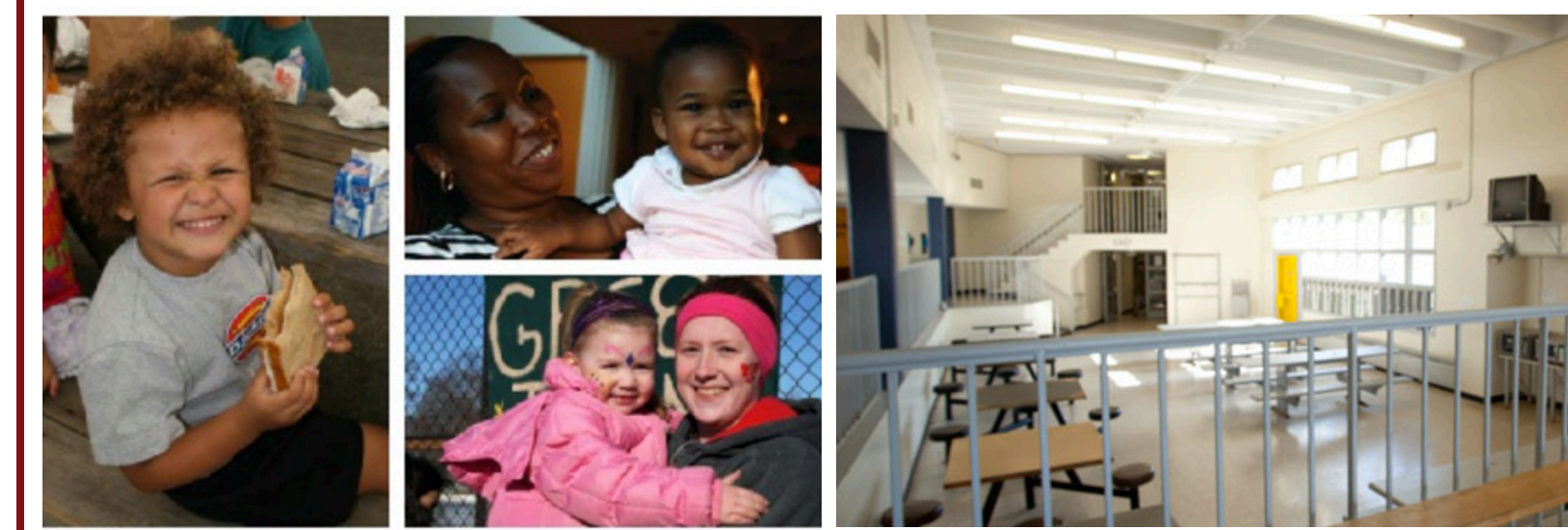
Left: Families and children served by Pernet Right: Inside of the Worcester County House of Correction

Pernet also works with families in other Worcester neighborhoods and nearby towns and with fathers in the Worcester County House of Correction.