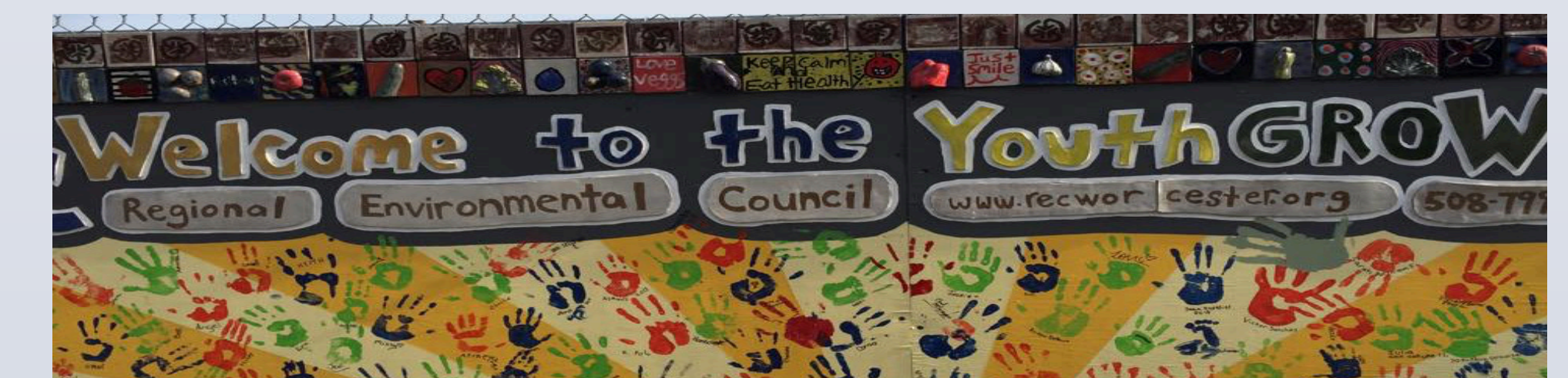
Regional Environmental Council Youth Grow Project inviting the city's youth to learn about business and gardening in the local areas of Worcester.