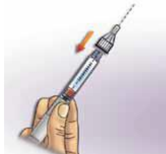
Step 6: Twist needle clockwise onto the pen