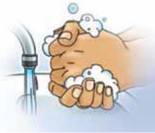
Step 1: Wash hands