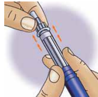
Step 7: Pull off the outer and inner covers