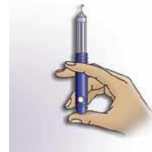
Step 8: Before each use, dial to 2 units and push to see insulin come out (3 units for Toujeo, 5 units for U-500)