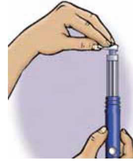
Step 4: Wipe rubber with alcohol