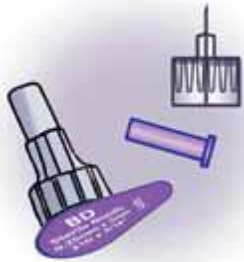
Step 5: Remove paper from pen needle