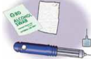
Step 2: Gather supplies