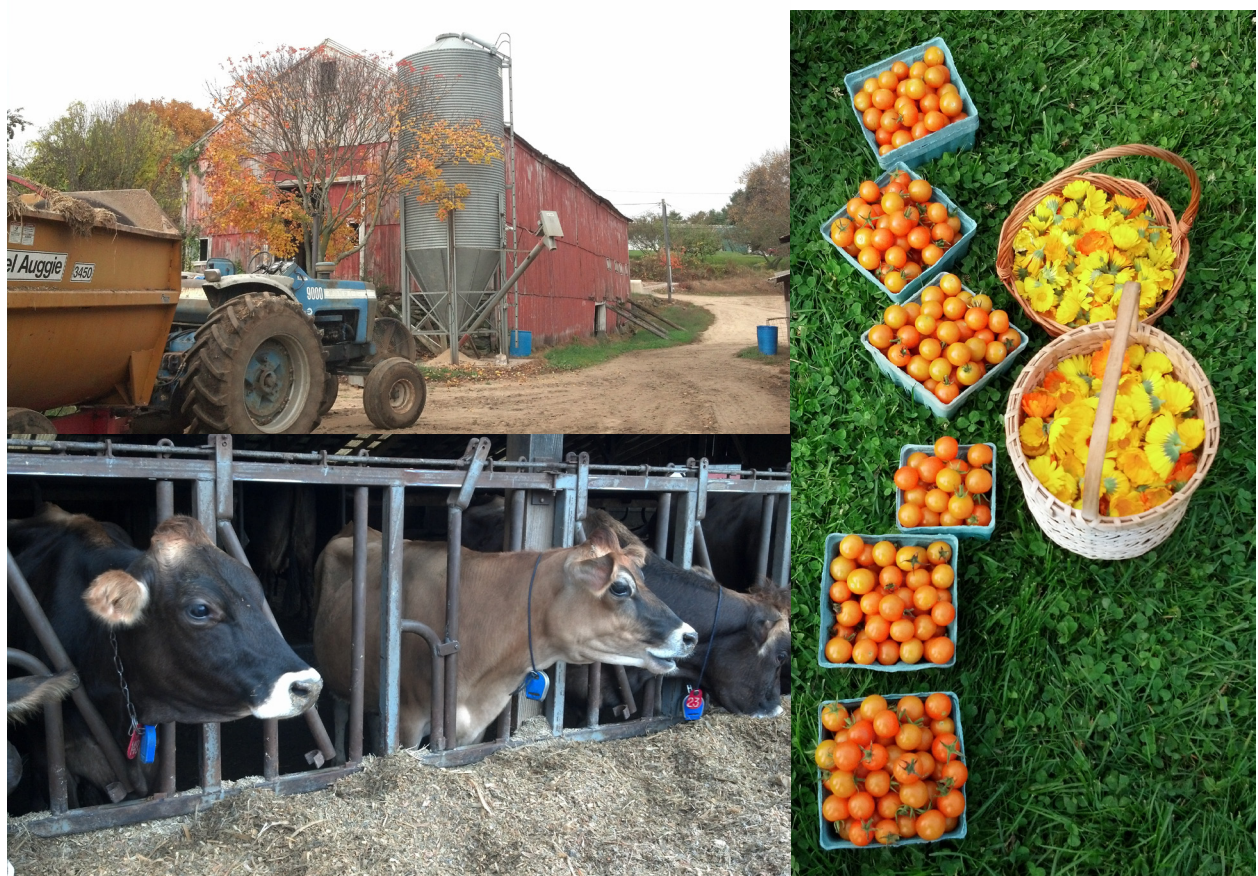
Figure 1. Photos from our visits to Imbier-Monson Farm in New Braintree, MA and Quabbin Regional High School in Barre, MA

We hope that the BFHC will use the information we gathered and the solutions we have considered to help guide their regional improvement efforts and community outreach programs going forward.