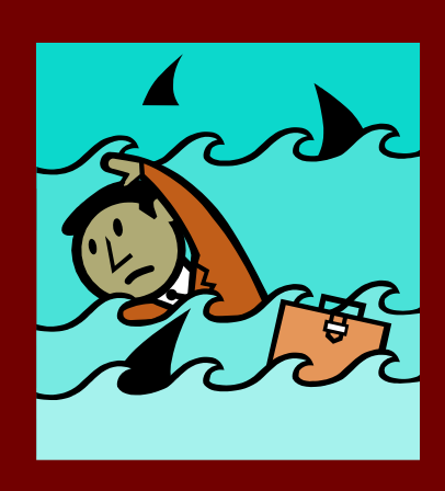
Milieu and Unit-Living