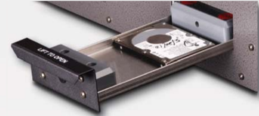
Laptop Hard Drives