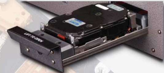
1.5" Hard Drives