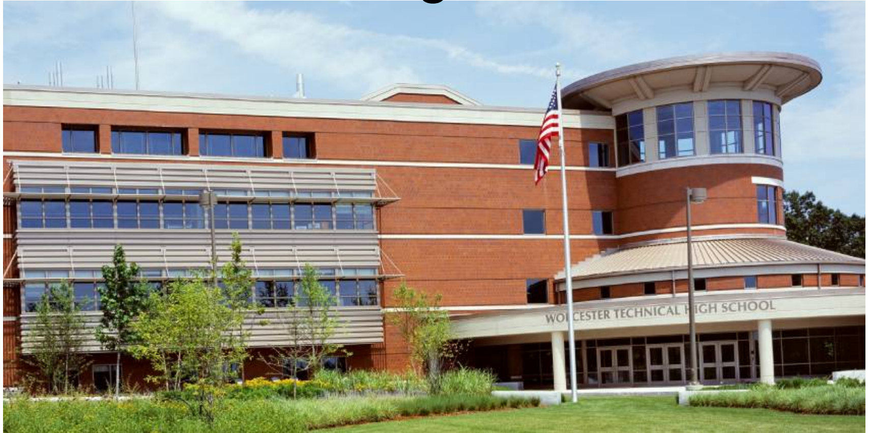
Worcester Technical High School