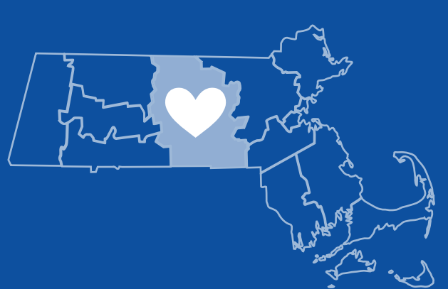
FOSTERING PARTNERSHIPS to Promote Health in Central Massachusetts