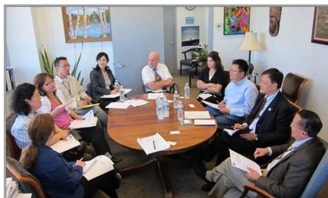
An engaging discussion