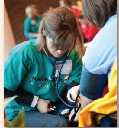
▲ GSN faculty and students performed health screenings and then referred athletes to onsite specialists.