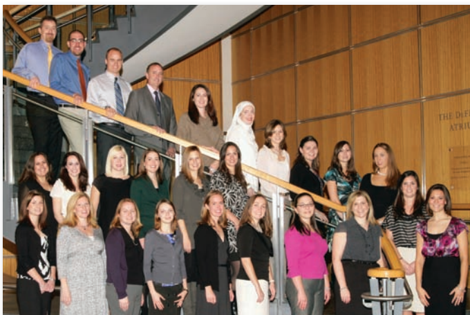
The Class of 2011 at the 2009 Graduate School of Nursing Graduate Entry Pathway Program Pinning Ceremony

You may make a secure online gift at www.umassmed.edu/foundation/onlinegiving or send your contribution to the UMass Medical School/UMass Memorial Development Office, 333 South Street, Shrewsbury, MA 01545.