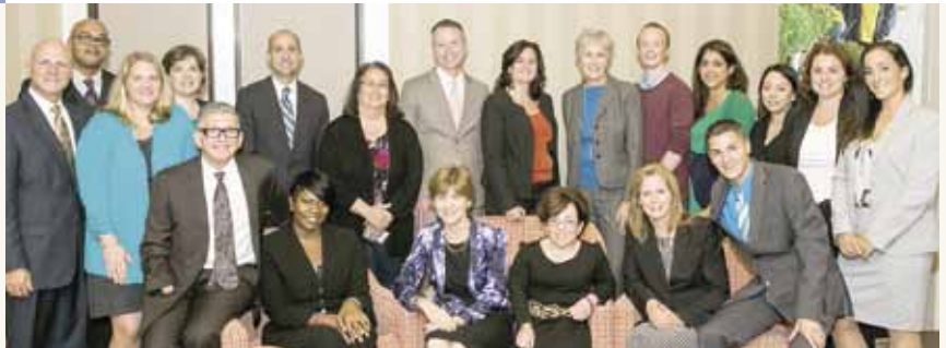
Representatives for various corporate sponsors and members of the business advisory council appear at the first Raise the Bar HIRE! Conference held in October 2013.

From initiating outreach to other employers to sponsoring networking and job fair events tailored to engaging the business community in disability diversity, these corporate sponsors have played an instrumental role in the success of Work Without Limits. Because of their outreach efforts and steadfast support, WWL has grown into a model B2B network that has made a notable impact on the lives of people with disabilities in Massachusetts and their families. As you can see here, the benefits have been mutual.