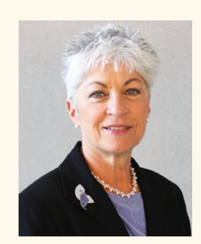
RESIDENCY & FELLOWSHIP PROGRAMS AT UMASS

For many, residency & fellowship training is a highlight of a career in medicine, combining the provision of advanced medical care with the opportunity to teach and learn.